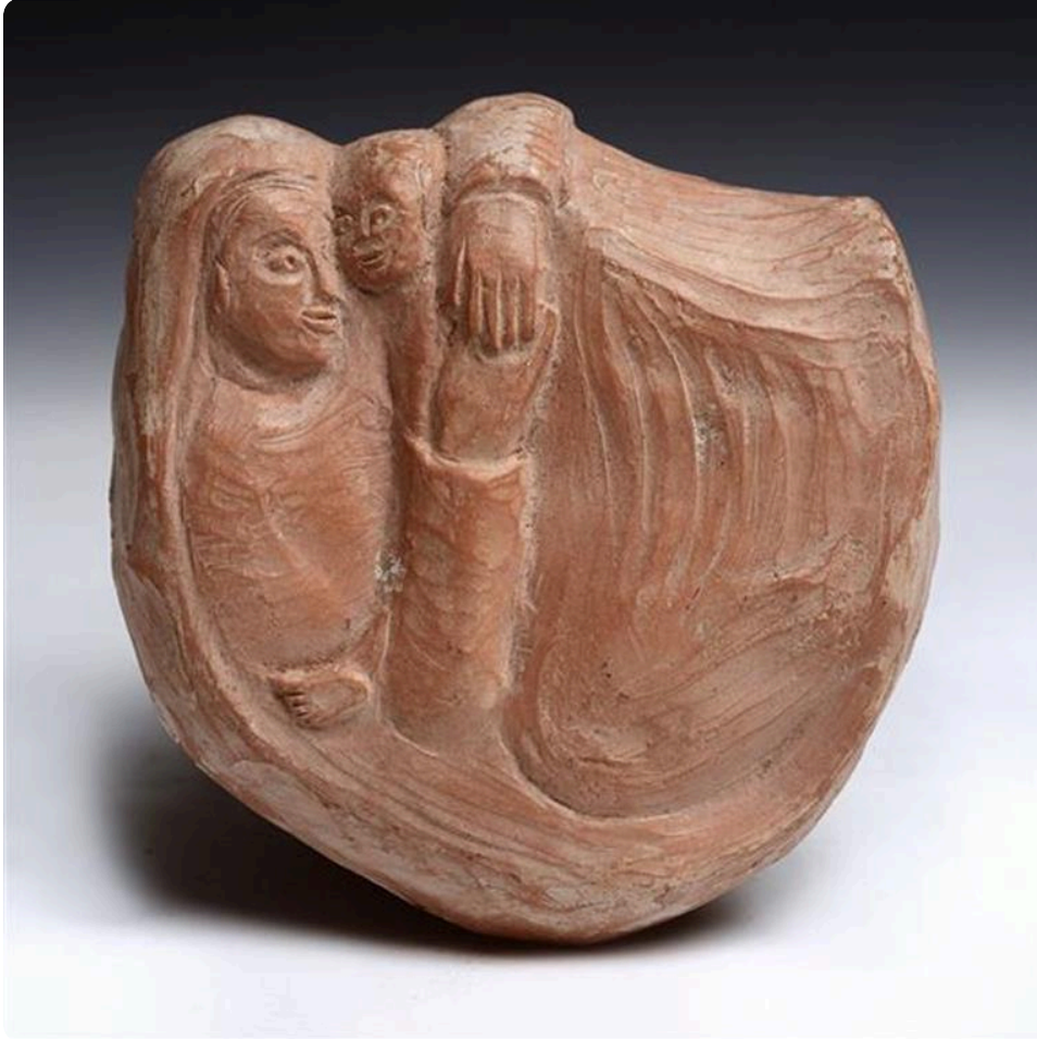
Madonna and Child