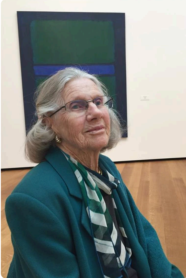
Mom at National Gallery