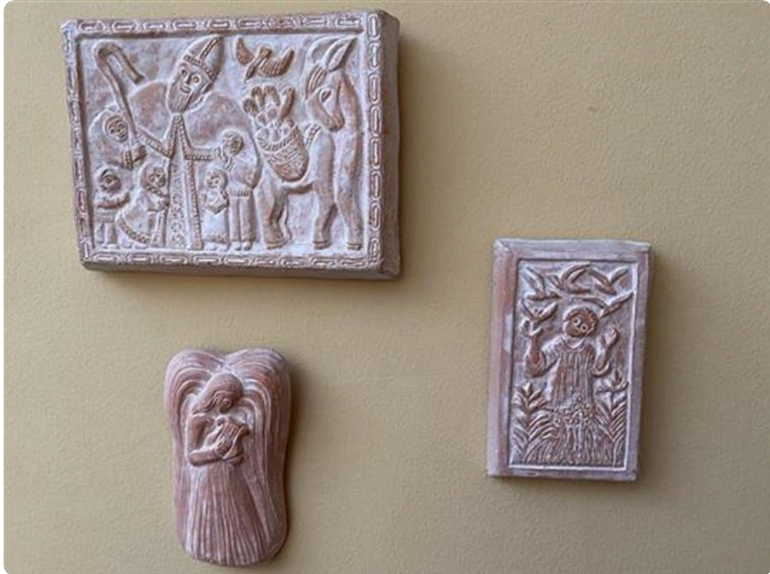
Terra cotta Reliefs